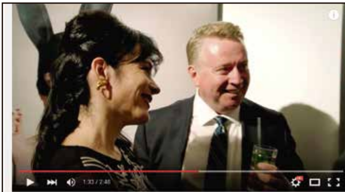
Opening night at the Maddox Gallery, Mayfair