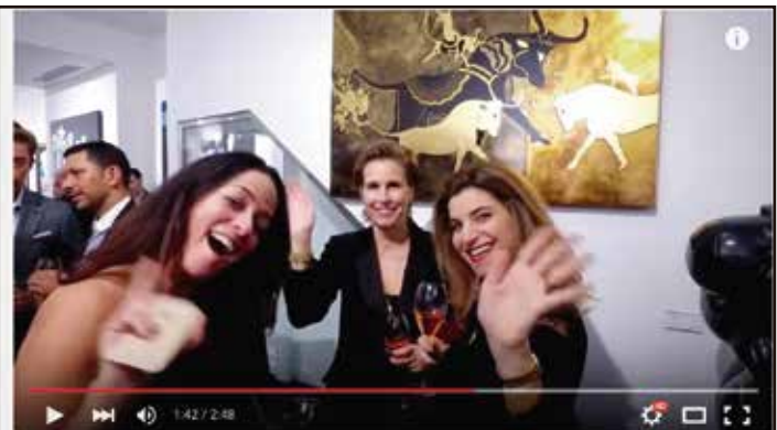
Opening night at the Maddox Gallery, Mayfair